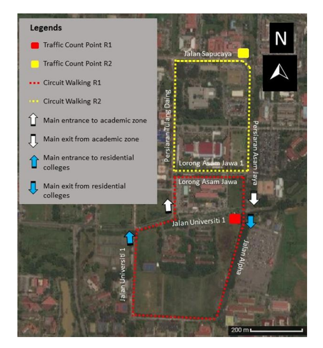
Figure 1 : Map showing sampling route on circuit walking Route 1 (R1 - red dots) and Route 2 (R2 - yellow dots) along university campus areas in Serdang, Malaysia.

For each site, researcher carried all sampling equipment and walked in clockwise circuit for three different sampling rush hours; morning (0730-0830), noon (1300-1400) and evening (1700-1800). Researcher started walking from traffic count point and ended the walk at the same point. The circuit walking route for R1 has approximately 1.8 km and for R2 is about 1.4 km. For R1, walking route comprised of Jalan Alpha, Jalan Universiti 1, Persiaran Tulang Daing, Lorong Asam Jawa and Persiaran Asam Jawa. Sampling was conducted along R2 which included Persiaran Tulang Daing, Jalan Sapucaya, Persiaran Asam Jawa and Lorong Asam Jawa 1. All measurements were conducted on separate days for each walking route R1 and R2.